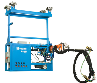
AccuFill Brake Fill Overhead Carrier with Tool Positioning Arm