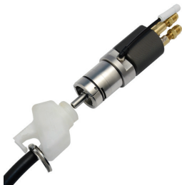
Single Port, Dripless, Auto Clamping and Sealing Fill Tool

AccuFill Brake Fill systems have been proving themselves on automobile, truck, motorcycle, construction vehicle and farm equipment assembly lines for many years.