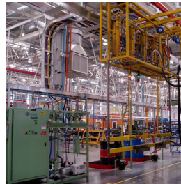
DataFill MultiFill System for Coolant, Diesel and Wiper Fluids