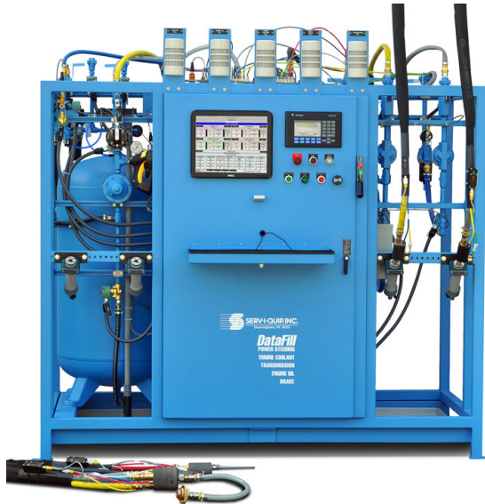
DataFill MultiFill Stop Station for Coolant, PS, Brake, Trans, and Engine Oil