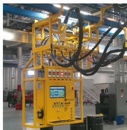
DataFill MultiFill System for Transmission, Diesel Fuel, Engine Oil, Coolant and Axle