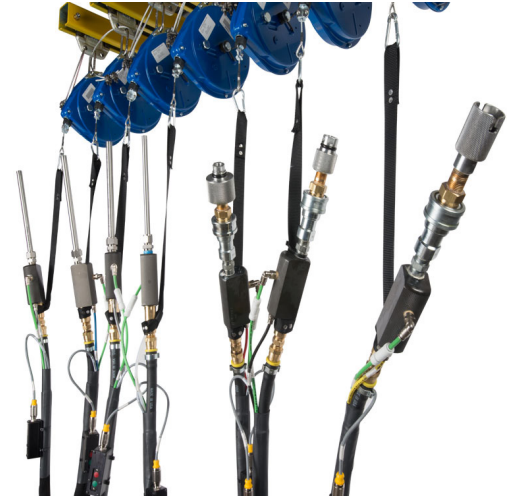
Transmission and Engine Oil Fill Tools with cycle start/stop switches and auto drop/retract