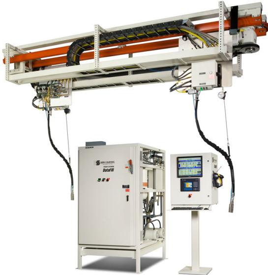
DataFill Power Steering Prep and Fill System