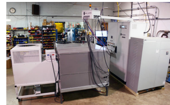
Multi Compressor Commercial Testing System with Rotating Boom, Duct Load Simulator, and 200 amp Variable Transformer