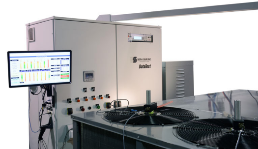
Multi Compressor Commercial Testing System