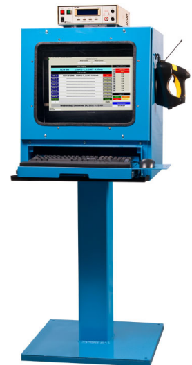
DataServ HiPot Test Station