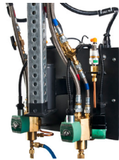
Rear View Operator Panel

Our new DataServ 3.0 Data Acquisition and Automated Process Control Software serves as a full featured HMI and provides web based remote access to system configuration, bar code and model configuration, production data, calibration, password management, PC and PLC programming updates, and troubleshooting. A new Dashboard can display multiple DataServ systems and key production values. Production analysis reports and an email notification system that delivers process alerts, notifications, or system events are newly available features.