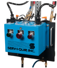
Boom mounted, pivoting Operator Panel